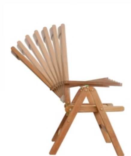
Back adjust to 7 different positions.

Natural fine hand sanded finish. Mortise and tenon joinery construction. Solid "A" grade Indonesian plantation teak. Full 1 year warranty against manufacturer's defects.